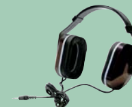
Hearing Protector Headphone HED 008