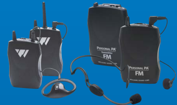
TGS 863 T863 Transmitter R863 Receiver 863 MHz

Contact our experienced sales staff for more information 1-800-843-3544 or 952-943-2252